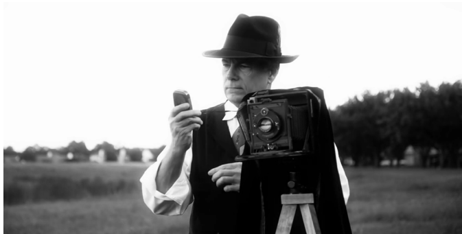
Figure 1. Manual video colorization is a difficult process.

VEGAS Pro contains many components that take advantage of the 12 th Gen Intel Core processor architecture, including built-in Intel DL Boost acceleration features. Among the AI-enabled video editing capabilities geared to professionals, colorization of black-and-white video segments yields impressive results, as shown in Figures 1 and 2.