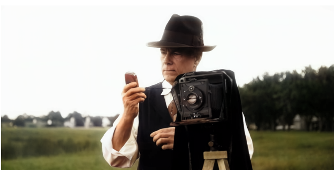
Figure 2. AI enables enhanced colorization operations.

Content upscaling is another feature that benefits professionals. Low-resolution footage can be intelligently scaled to integrate with higher resolution video formats, maintaining a high degree of visual fidelity.